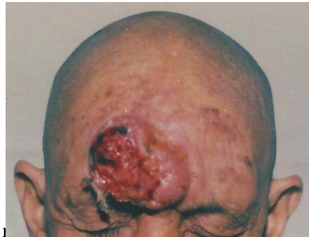
Large squamous cell carcinoma on forehead in an old man.

A 73-year-old female presented with SCC on the left cheek. The tumour was excised and the defect was closed with local rotational flap ( Figure 3 ).