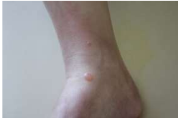
Figure 2 A large and small blister on diffuse erythema underneath present near right ankle.