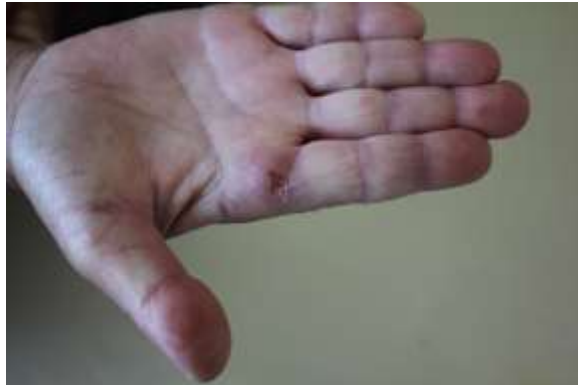
Figure 1 Centrally crusted lesion of orf present on the proximal to the root of right index finger.